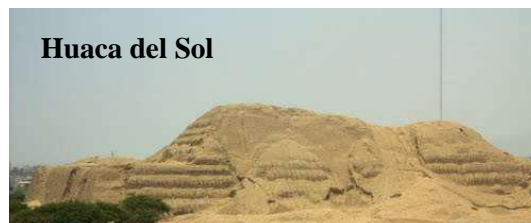
Huaca del Sol